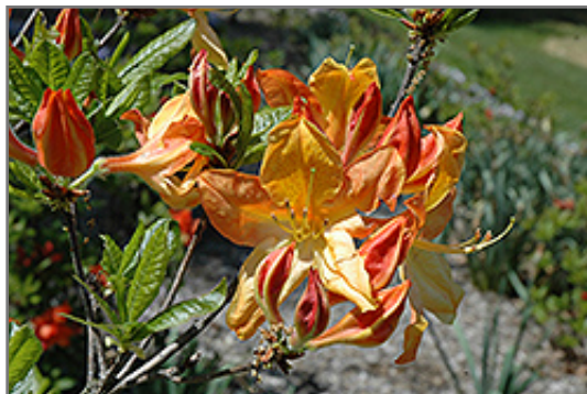
Arneson Gem Azalea flowers

Arneson Gem Azalea will grow to be about 4 feet tall at maturity, with a spread of 6 feet. It tends to be a little leggy, with a typical clearance of 1 foot from the ground. It grows at a slow rate, and under ideal conditions can be expected to live for 40 years or more.