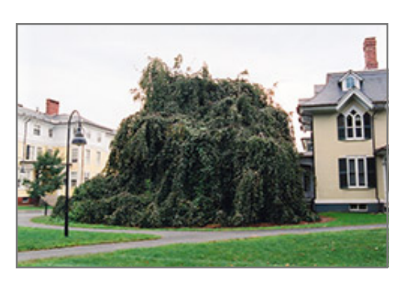
Weeping Purple Beech

An awe-inspiring and graceful accent tree with swooping, pendulous branches and rich purple foliage all season; requires a great deal of room to grow; quite particular about growing conditions, requires rich soil and significant moisture