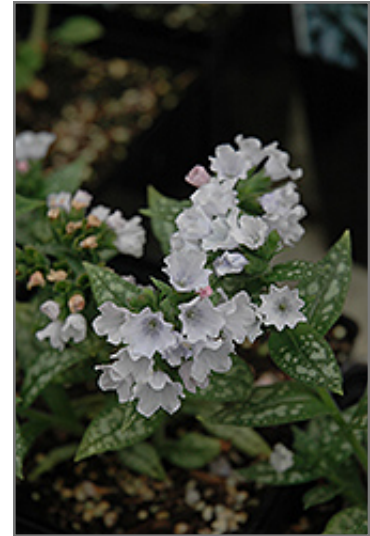
Silverado Lungwort flowers