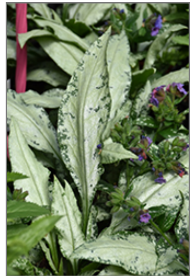
Silver Bouquet Lungwort foliage