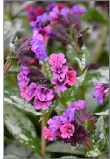
Silver Bouquet Lungwort flowers

This is a relatively low maintenance plant, and should be cut back in late fall in preparation for winter. It is a good choice for attracting hummingbirds to your yard, but is not particularly attractive to deer who tend to leave it alone in favor of tastier treats. It has no significant negative characteristics.