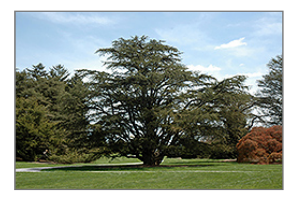
Atlas Cedar

Atlas Cedar will grow to be about 50 feet tall at maturity, with a spread of 40 feet. It has a low canopy with a typical clearance of 5 feet from the ground, and should not be planted underneath power lines. It grows at a slow rate, and under ideal conditions can be expected to live for 80 years or more.