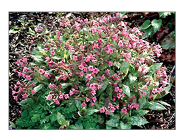
Bubble Gum Lungwort in bloom

This captivating variety displays clusters of deep pink blooms over clumps of interesting light green foliage that is variegated with silver; a beautiful accent all season long for the shaded area; trim after blooming to rejuvinate foliage