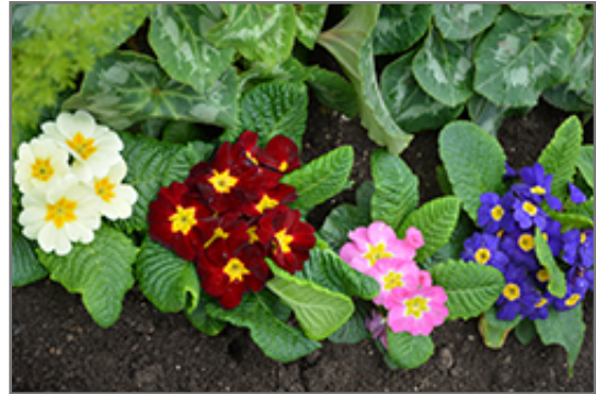
Primrose in bloom