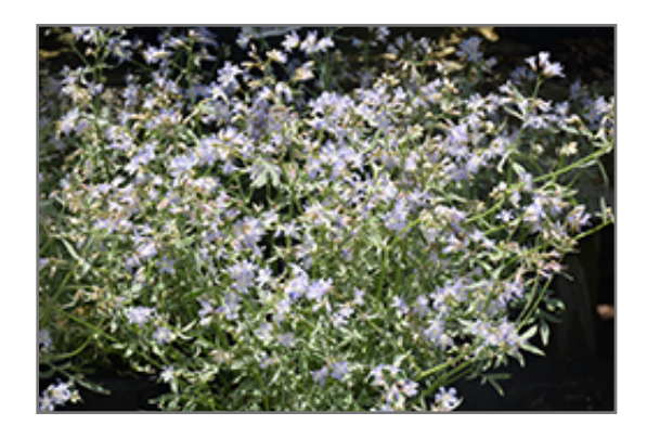
Touch Of Class Jacob's Ladder flowers

This plant will require occasional maintenance and upkeep, and is best cleaned up in early spring before it resumes active growth for the season. Deer don't particularly care for this plant and will usually leave it alone in favor of tastier treats. It has no significant negative characteristics.