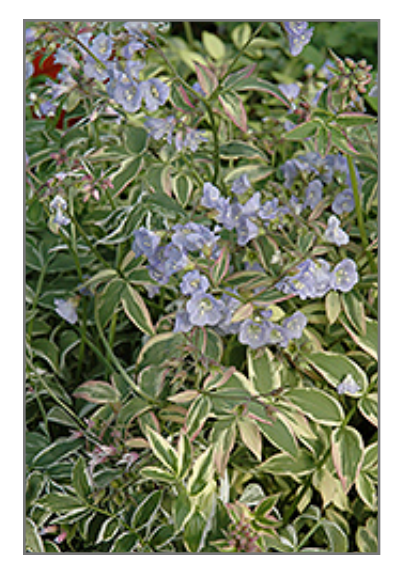
Touch Of Class Jacob's Ladder flowers

Touch Of Class Jacob's Ladder is an herbaceous perennial with tall flower stalks held atop a low mound of foliage. It brings an extremely fine and delicate texture to the garden composition and should be used to full effect.