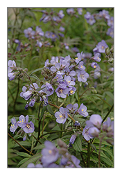
Heaven Scent Jacob's Ladder flowers

Heaven Scent Jacob's Ladder is recommended for the following landscape applications;