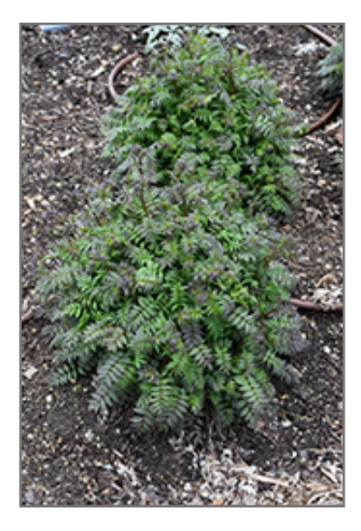
Heaven Scent Jacob's Ladder