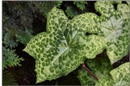
Spotty Dotty Asian Mayapple foliage