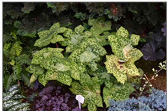
Spotty Dotty Asian Mayapple