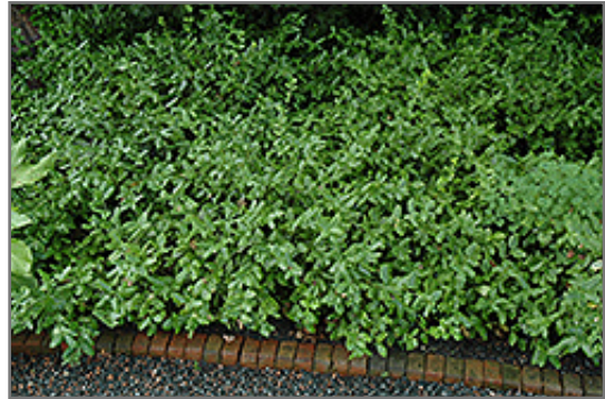
Sarcoxie Wintercreeper

This shrub performs well in both full sun and full shade. It is very adaptable to both dry and moist locations, and should do just fine under average home landscape conditions. It is not particular as to soil type or pH. It is highly tolerant of urban pollution and will even thrive in inner city environments, and will benefit from being planted in a relatively sheltered location. This is a selected variety of a species not originally from North America.