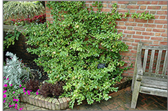
Sarcoxie Wintercreeper

Sarcoxie Wintercreeper is recommended for the following landscape applications;