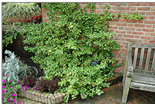
Sarcoxie Wintercreeper