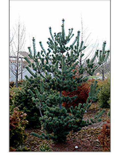
Cleary Japanese White Pine

Cleary Japanese White Pine is recommended for the following landscape applications;