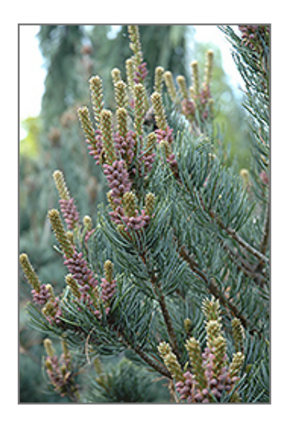
Cleary Japanese White Pine foliage