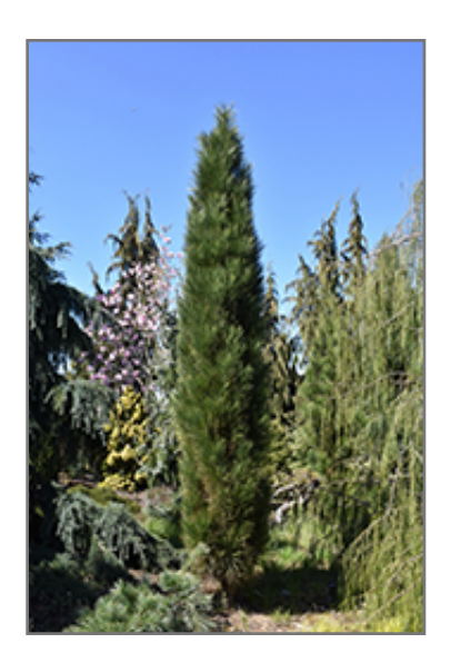
Green Tower Austrian Pine

Green Tower Austrian Pine will grow to be about 20 feet tall at maturity, with a spread of 6 feet. It has a low canopy, and is suitable for planting under power lines. It grows at a medium rate, and under ideal conditions can be expected to live for 40 years or more.