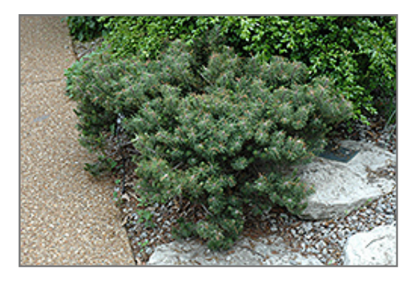
Paul's Dwarf Mugo Pine