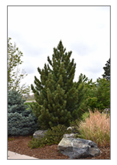
Emerald Arrow Bosnian Pine