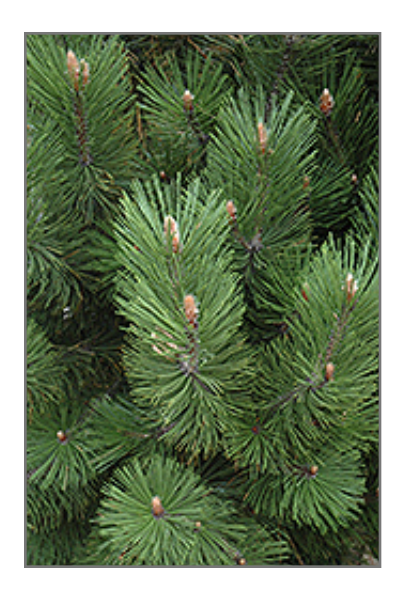
Emerald Arrow Bosnian Pine foliage