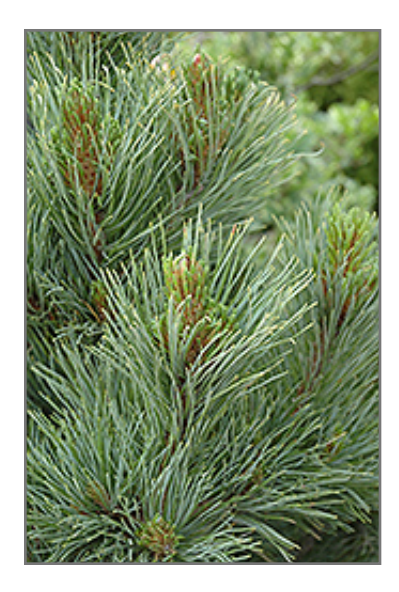
Blue Swiss Stone Pine foliage