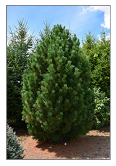
Blue Swiss Stone Pine

Blue Swiss Stone Pine is recommended for the following landscape applications;