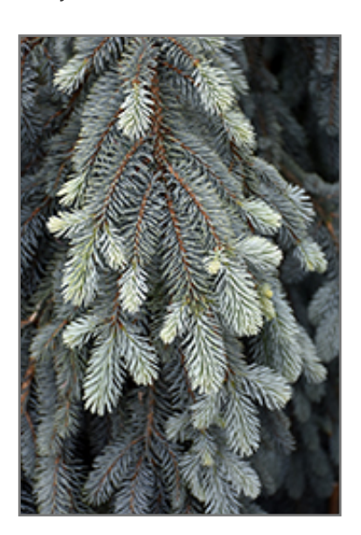
The Blues Colorado Blue Spruce foliage

This is a relatively low maintenance tree. When pruning is necessary, it is recommended to only trim back the new growth of the current season, other than to remove any dieback. Deer don't particularly care for this plant and will usually leave it alone in favor of tastier treats. It has no significant negative characteristics.