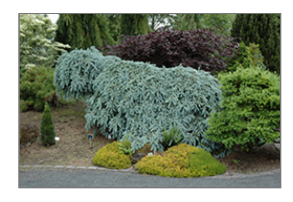
The Blues Colorado Blue Spruce

The Blues Colorado Blue Spruce is a dense evergreen tree with a rounded form and gracefully weeping branches. Its average texture blends into the landscape, but can be balanced by one or two finer or coarser trees or shrubs for an effective composition.