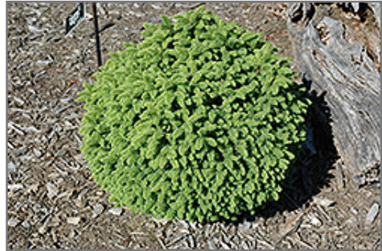
Humphrey's Gem Norway Spruce

Humphrey's Gem Norway Spruce is recommended for the following landscape applications;