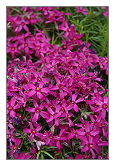
Purple Moss Phlox flowers

This variety has volumes of rich hot pink flowers which blanket the low growing fine foliage in late spring; makes a tremendous color impact which will attract the eye even from a distance