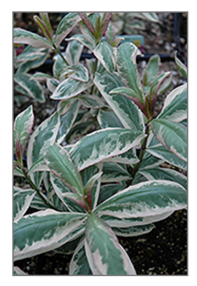
Rubymine Garden Phlox foliage

Exceptionally long blooms of fragrant pink flowers with a deeper pink near the center, that bloom prolifically all summer, exotic sea green foliage with cream edges and hints of red adds intrest; suitable for borders; good mildew resistance