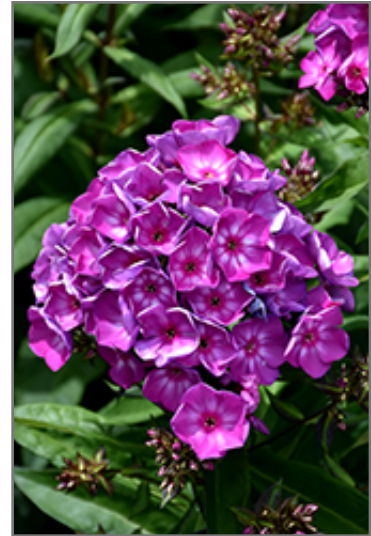
Grape Lollipop Garden Phlox flowers

Grape Lollipop Garden Phlox is recommended for the following landscape applications;