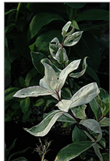
Montrose Tricolor Phlox foliage