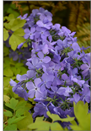
Blue Moon Phlox flowers