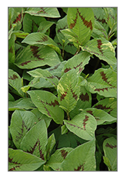
Painter's Palette Fleeceflower foliage

Grown for its colorful foliage; varigated with cream and light green with an unusual V-shaped chocolate brown marking; beautiful when massed as a groundcover or based in containers