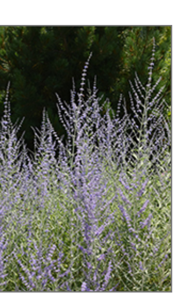
Filigran Russian Sage flowers

This is a relatively low maintenance plant, and is best cut back to the ground in late winter before active growth resumes. It is a good choice for attracting butterflies to your yard, but is not particularly attractive to deer who tend to leave it alone in favor of tastier treats. It has no significant negative characteristics.