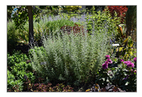
Filigran Russian Sage in bloom

Filigran Russian Sage is recommended for the following landscape applications;