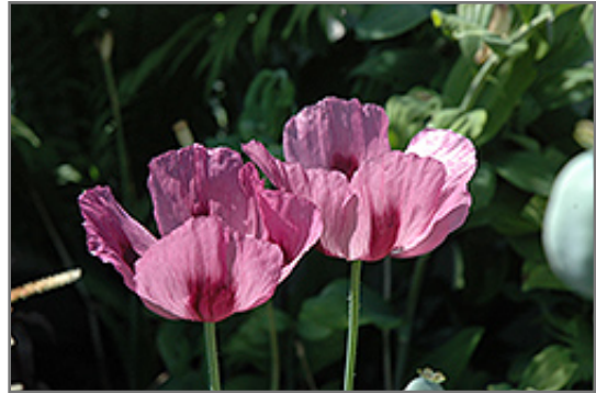
Patty's Plum Poppy flowers