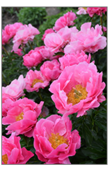
Paula Fay Peony flowers

This is a relatively low maintenance plant, and should be cut back in late fall in preparation for winter. Deer don't particularly care for this plant and will usually leave it alone in favor of tastier treats. Gardeners should be aware of the following characteristic(s) that may warrant special consideration;