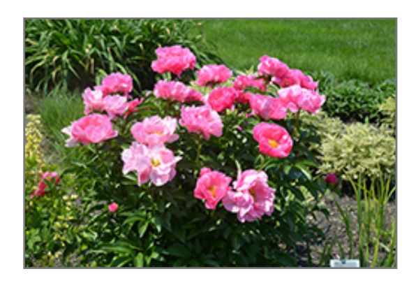
Paula Fay Peony in bloom