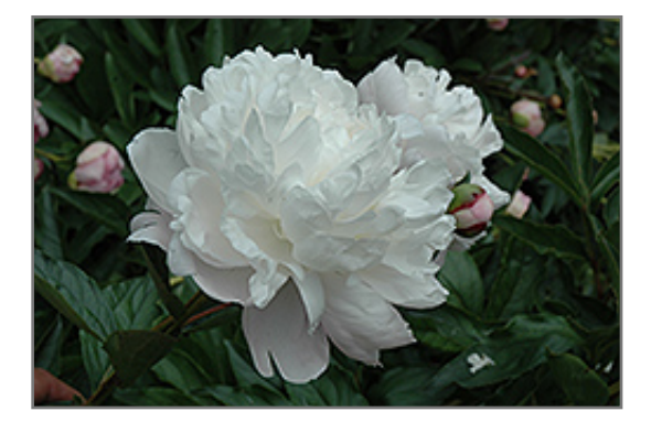
Nick Shaylor Peony flowers