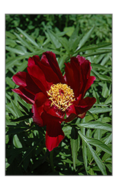
Early Scout Peony flowers

Early Scout Peony features bold lightly-scented crimson cup-shaped flowers with yellow centers at the ends of the stems from late spring to early summer. The flowers are excellent for cutting. Its compound leaves remain dark green in colour throughout the season.