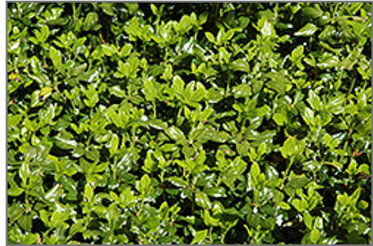
Crystal Japanese Spurge foliage

Crystal Japanese Spurge will grow to be about 8 inches tall at maturity, with a spread of 18 inches. Its foliage tends to remain low and dense right to the ground. It grows at a slow rate, and under ideal conditions can be expected to live for approximately 20 years. As an evergreen perennial, this plant will typically keep its form and foliage year-round.