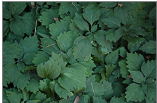
Allegheny Spurge foliage