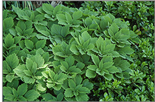
Allegheny Spurge