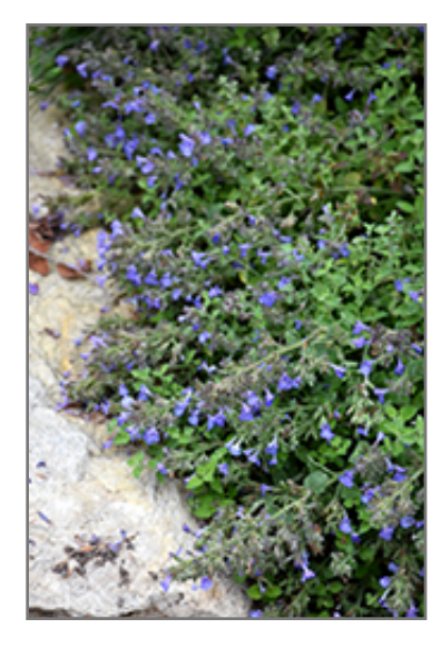
Kit Kat Catmint in bloom