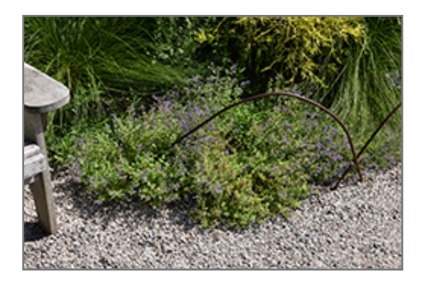
Kit Kat Catmint in bloom