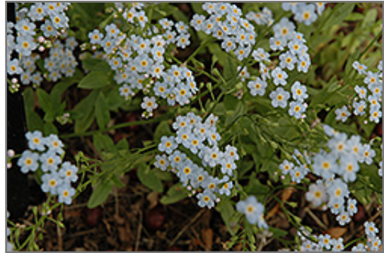
Everblooming Forget-Me-Not flowers

Everblooming Forget-Me-Not is recommended for the following landscape applications;