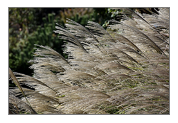
Gracillimus Maiden Grass fruit