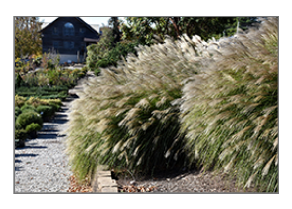
Gracillimus Maiden Grass

This plant will require occasional maintenance and upkeep, and is best cleaned up in early spring before it resumes active growth for the season. It has no significant negative characteristics.