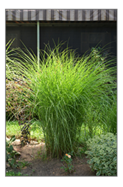
Gracillimus Maiden Grass

Gracillimus Maiden Grass will grow to be about 4 feet tall at maturity extending to 6 feet tall with the flowers, with a spread of 4 feet. It tends to be leggy, with a typical clearance of 1 foot from the ground, and should be underplanted with lower-growing perennials. It grows at a medium rate, and under ideal conditions can be expected to live for approximately 20 years. As an herbaceous perennial, this plant will usually die back to the crown each winter, and will regrow from the base each spring. Be careful not to disturb the crown in late winter when it may not be readily seen!