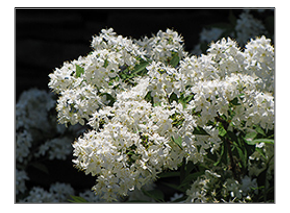
Compact Lemoine Deutzia flowers

Compact Lemoine Deutzia is recommended for the following landscape applications;