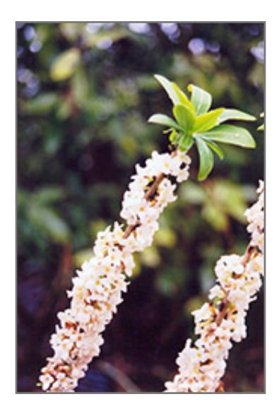
White February Daphne flowers

White February Daphne will grow to be about 4 feet tall at maturity, with a spread of 4 feet. It tends to fill out right to the ground and therefore doesn't necessarily require facer plants in front. It grows at a slow rate, and under ideal conditions can be expected to live for approximately 20 years.