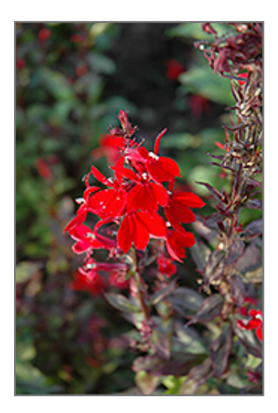
Queen Victoria Lobelia flowers