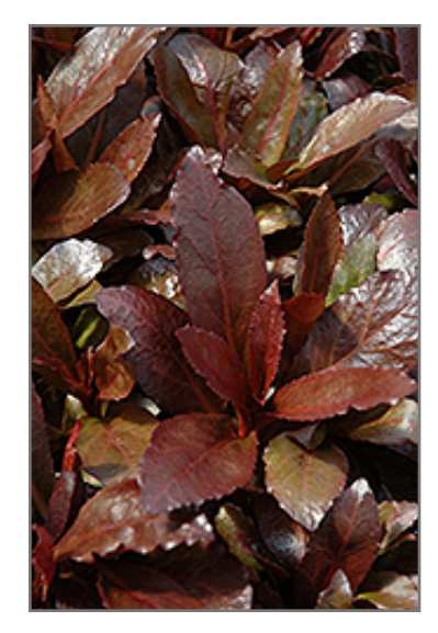
Queen Victoria Lobelia foliage