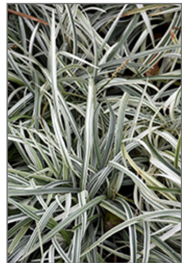
Silver Dragon Lily Turf