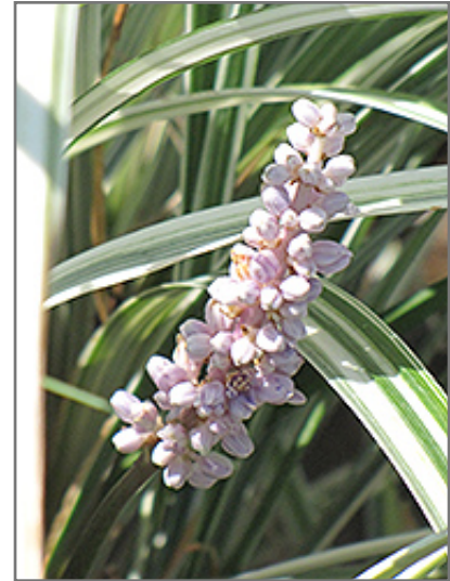
Silver Dragon Lily Turf flowers

Silver Dragon Lily Turf is recommended for the following landscape applications;