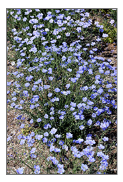
Sapphire Perennial Flax in bloom

Sapphire Perennial Flax is recommended for the following landscape applications;