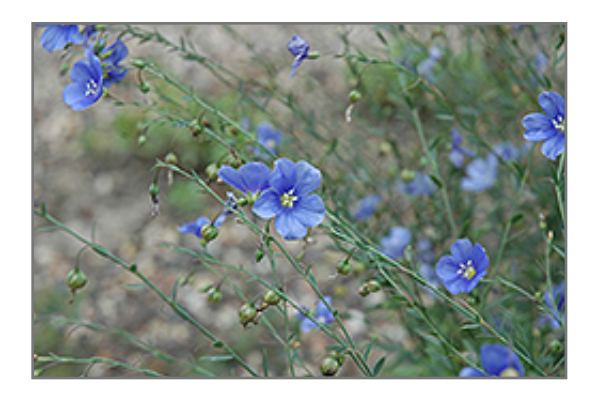
Sapphire Perennial Flax flowers