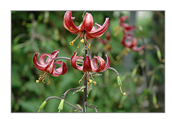
Claude Shride Martagon Lily flowers