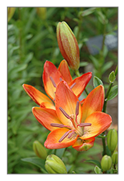
Toyland Lily flowers

Cuplike flowers of a soft orange and golden yellow blend hover gracefully on long stems; dark anthers and spotted flower buds make this beauty appear as if it is ablaze in the garden