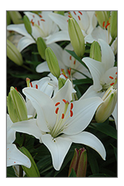
Lily Looks Tiny Snowflake Lily flowers