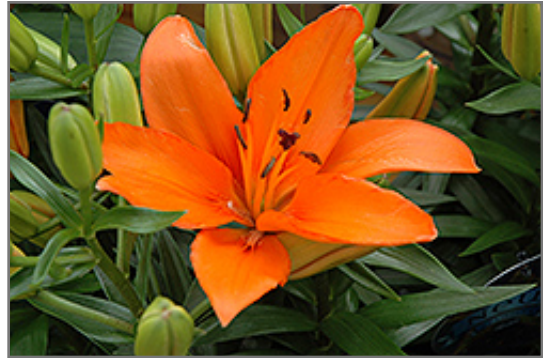
Lily Looks Tiny Dino Lily flowers