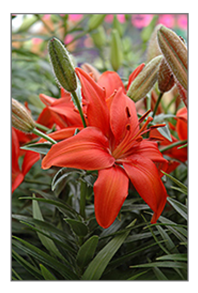
Mount Dragon Lily flowers

This early blooming dwarf variety has light scarlet flowers that darken toward the center; fast growing and floriferous with upward facing flowers on short stems