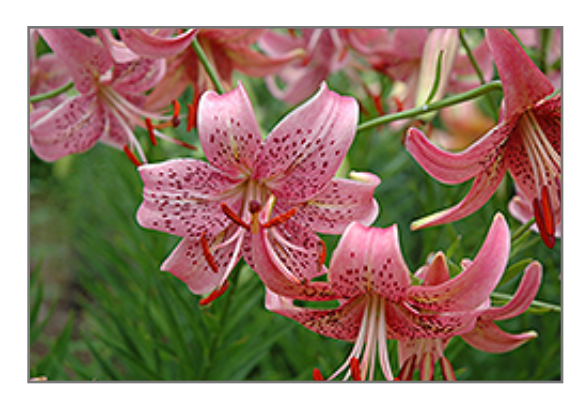
Embarrassment Lily flowers