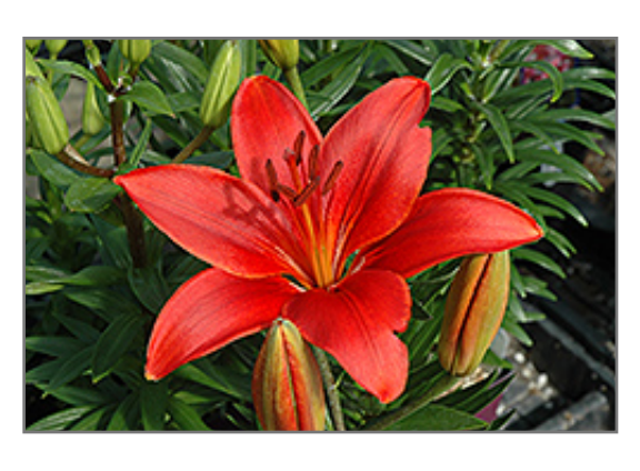
Crimson Pixie Lily flowers