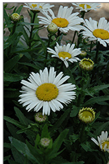
Snow Lady Shasta Daisy flowers

Snow Lady Shasta Daisy is recommended for the following landscape applications;