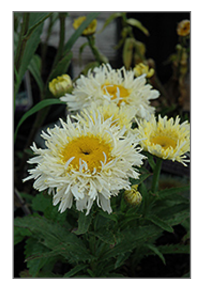
Gold Rush Shasta Daisy flowers