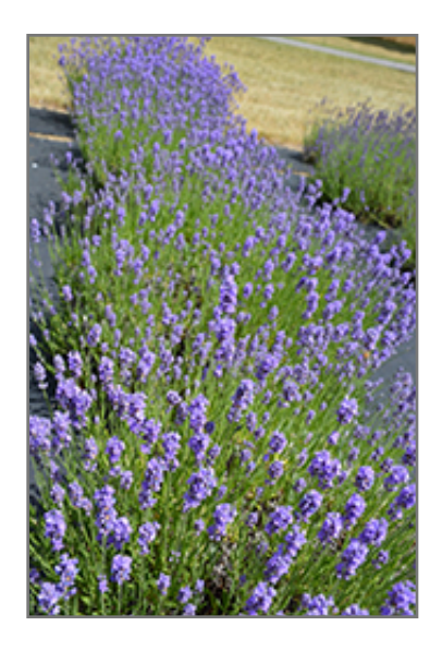
Hidcote Blue Lavender in bloom