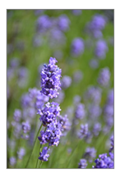
Hidcote Blue Lavender flowers