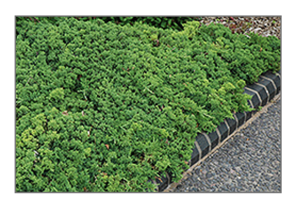
Green Mound Dwarf Japanese Juniper

This is a relatively low maintenance shrub, and is best pruned in late winter once the threat of extreme cold has passed. Deer don't particularly care for this plant and will usually leave it alone in favor of tastier treats. It has no significant negative characteristics.