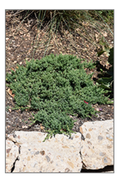
Green Mound Dwarf Japanese Juniper